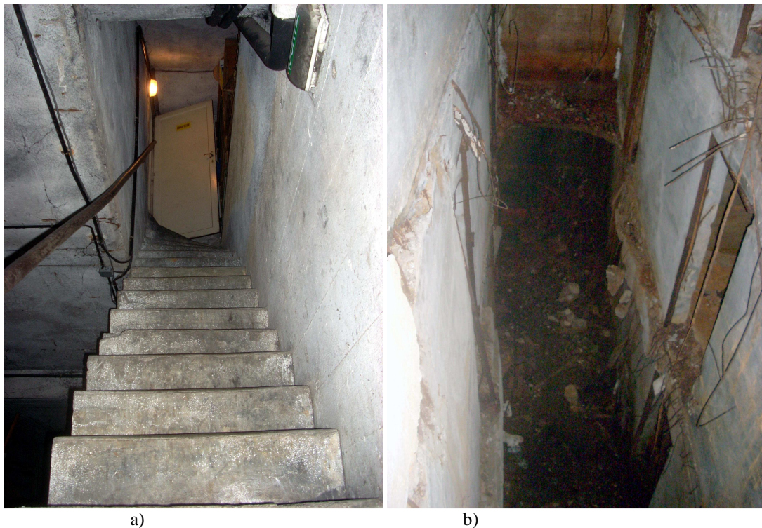
Figure 3. C.I.C. building: a) descent stair through the 1.25 m thick concrete layer to the first underground floor; b) opening in the first underground floor and vision of the second and third devastated underground floors