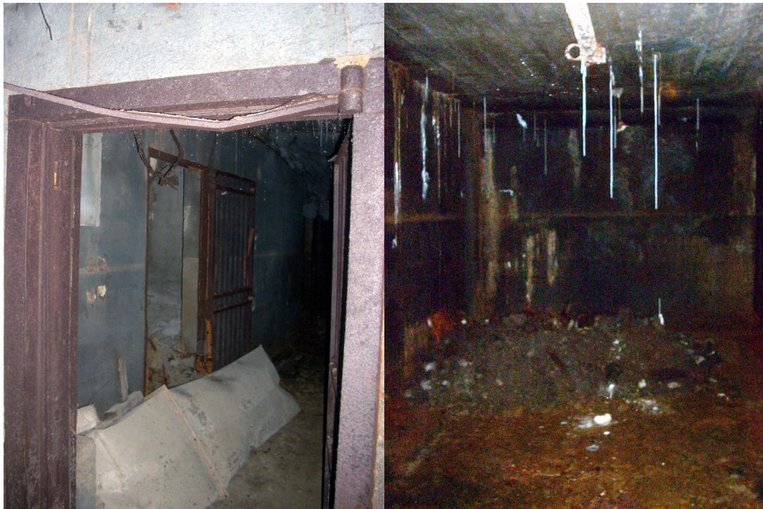
Figure 8. C.I.C. building: a), b) damages in the second underground floor seen from the third underground floor