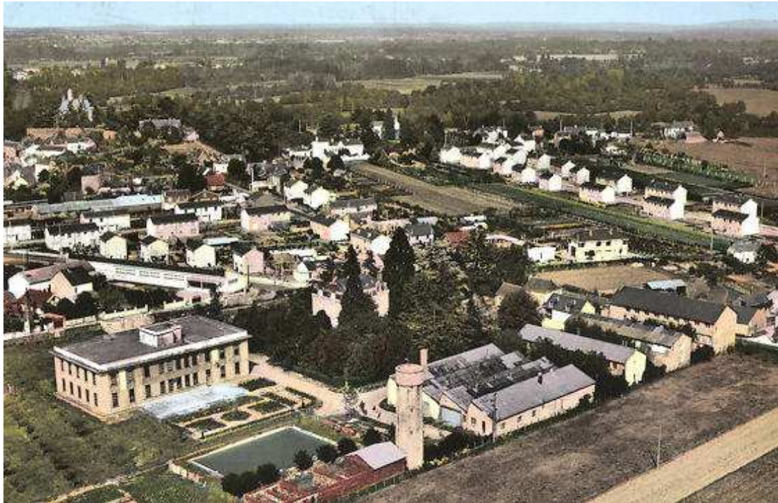
Figure 2. The Bank - after war image; on the left: C.I.C. building with place of the anti-aircraft gun on the roof, pool and water tower; in the middle: castle of La Dubinière partially masked by trees; on the right: garages and the three barracks for hosting soldiers and different services – visible, between the first and the last barrack, is the demolished barrack