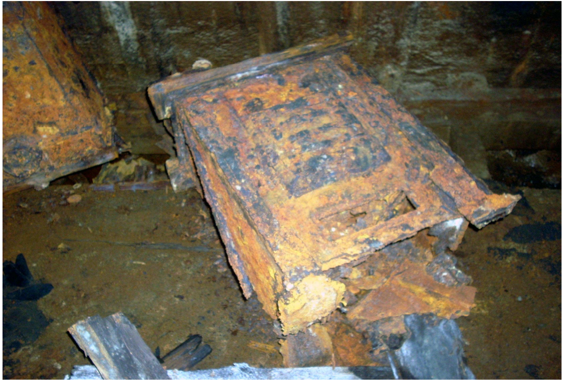
Figure 14. C.I.C. building: kitchen furniture of probable German origin