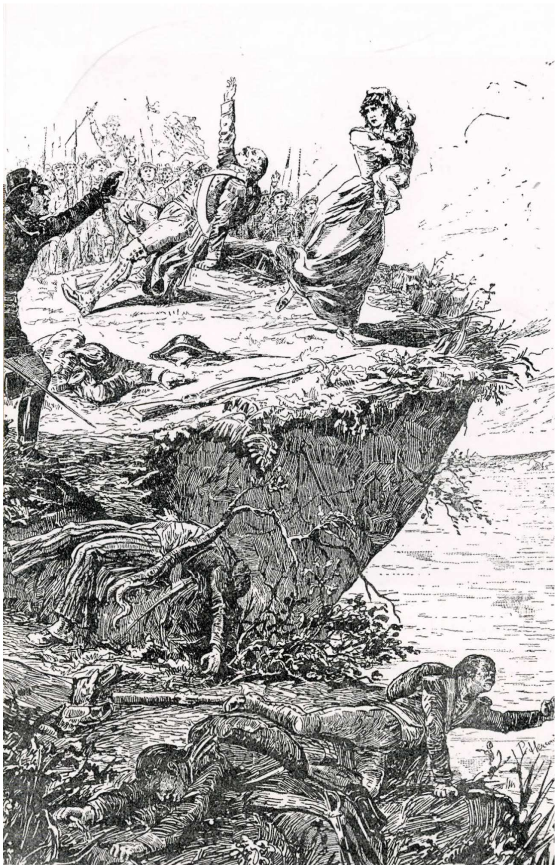
La bataille de Ponts-de-Cé en 1793 (E.Bonnemère, les guerres de Vendée, 1884)