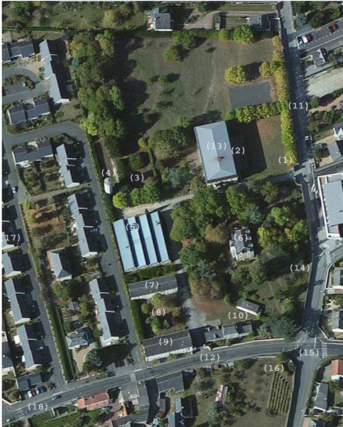
Figure 1. The Bank and the Domaine de La Dubinière (47° 24' 4,3" ; 0° 31' 36.6" W): (1) main entrance; (2) C.I.C. building; (3) pool - nowadays filled by ground; (4) water tower; (5) garages; (6) castle of La Dubinière - lodgments of German officers; (7) - (9) barracks – lodgements of soldiers, infirmary and different services; (8) place of a demolished barrack; (10) dependences of the castle; (11) Saint Vincent road; (12) Louis Rabineau road; (13) placement of a 20 mm antiaircraft double gun; (14) machine gun casemate; (15) machine gun casemate; (16) machine gun casemate; (17) machine gun casemate; (18) antitank obstacle - [Flash Earth]