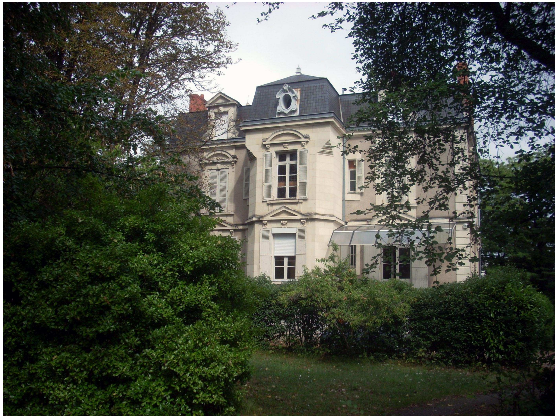
Figure 21. Castle of La Dubinière - lodgement of the German officers of the Bank