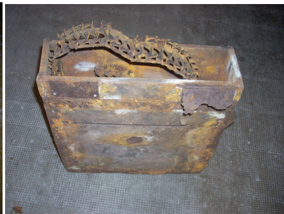
Figure 17. C.I.C. building: a) German ammunition box; b) German ammunition box with ammunition band