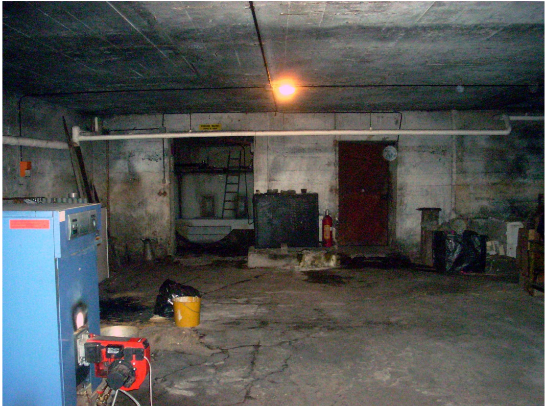
Figure 4. C.I.C. building: first underground floor - rooms of the heating system and fuel tanks on the left side the modern gas heating system