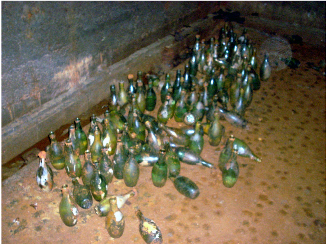
Figure 16. Bottles of mineral water Perrier survived to the explosions and the fire in the third underground floor