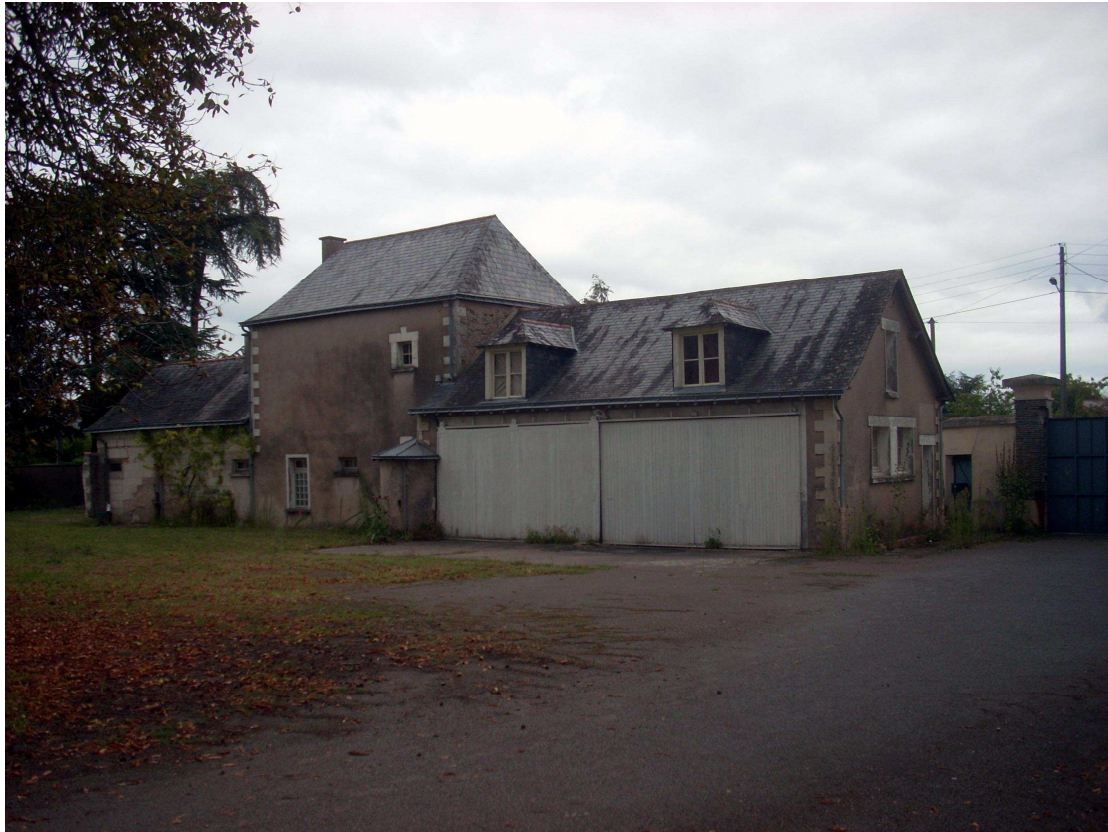
Figure 22. Castle dependences - the great doors on the facade suggest a possible vehicle garage or repair store utilization of a portion of the dependences