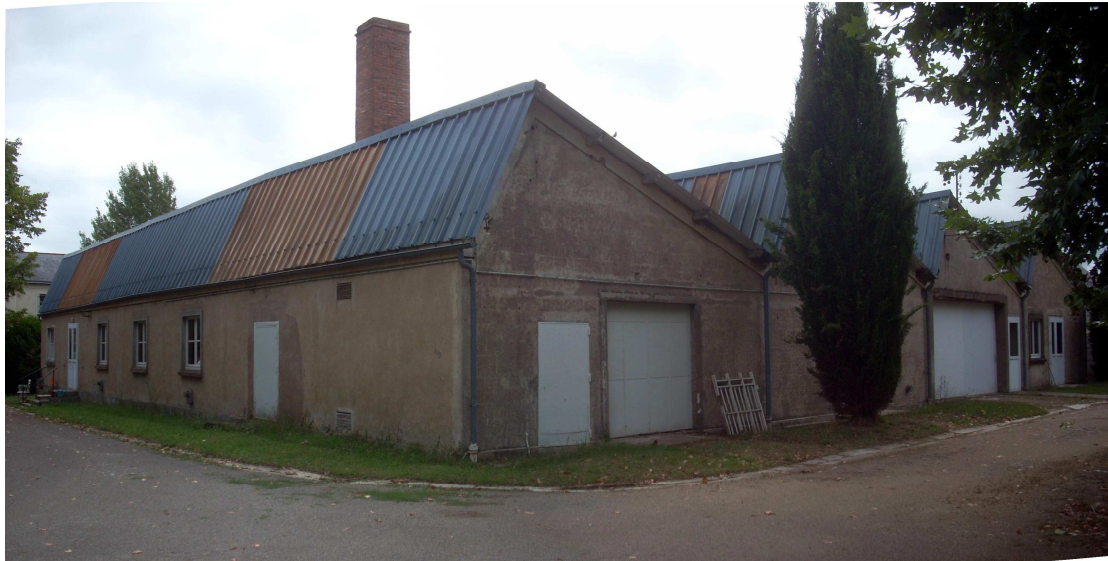
Figure 18. Garages