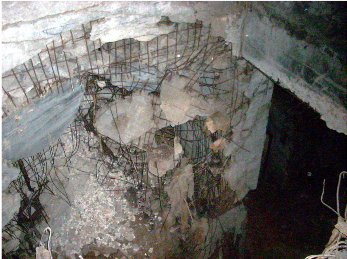
Figure 6. C.I.C. building: devastated second underground floor and vision to the third underground floor