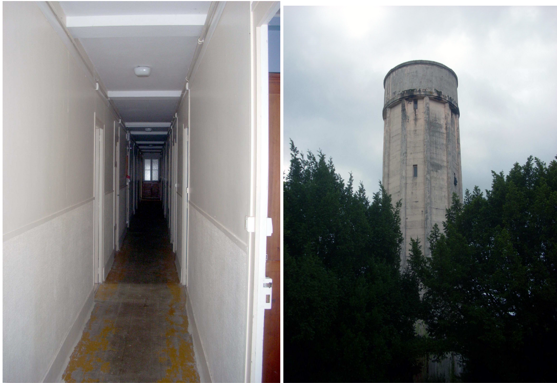
a) b) Figure 20. a) interior of the soldier barrack; b) water tower