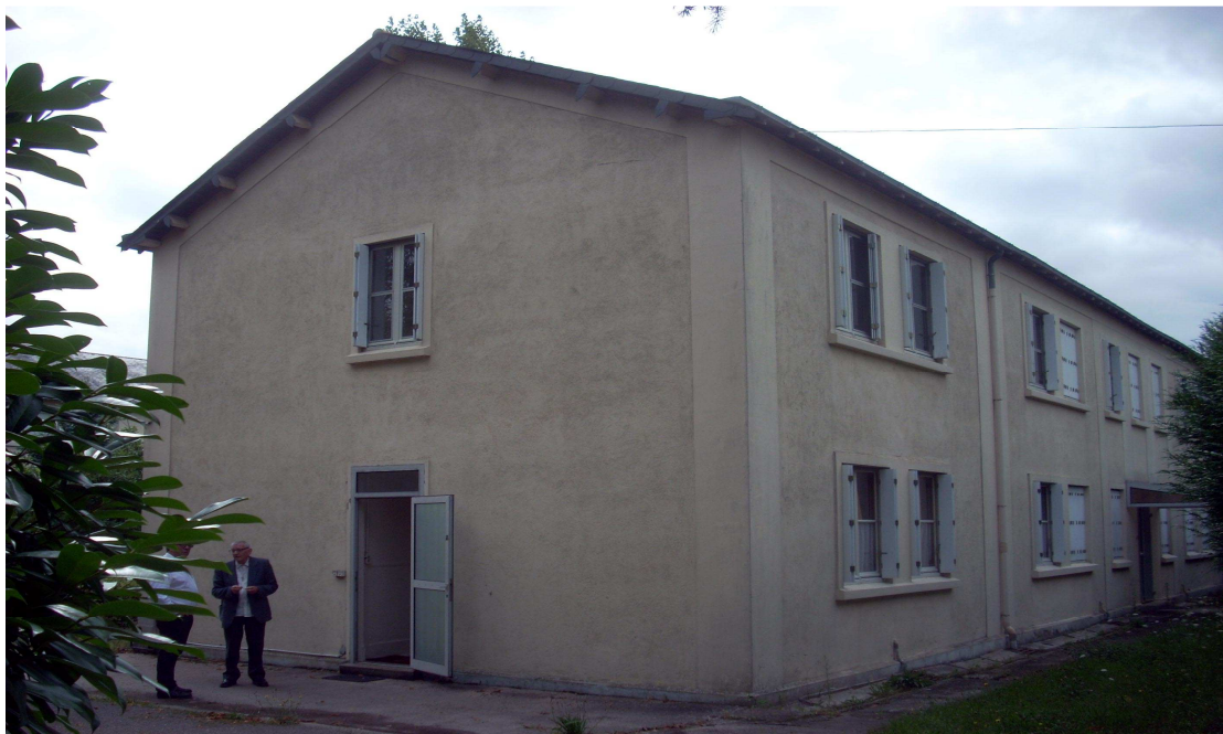
Figure 19. Barrack for lodging German soldiers