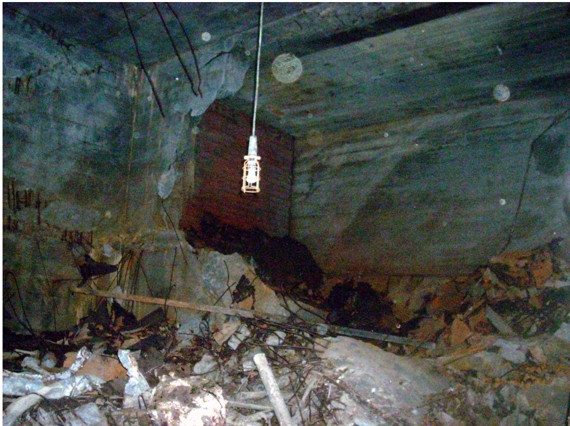
Figure 11. C.I.C. building: damages in the third underground floor