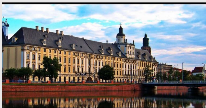
University of Wrocław (top); Oratorium Marianum (below).