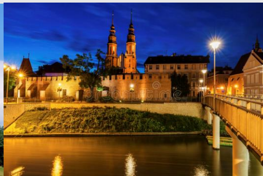
Opole Old Town